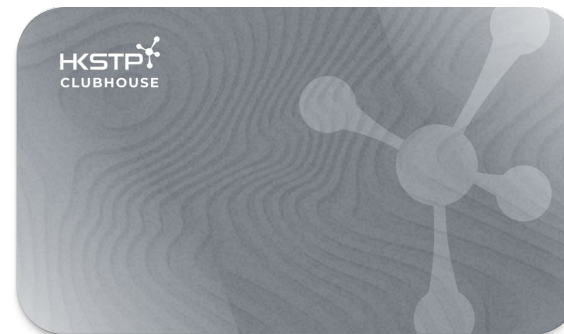
SILVER 銀級 會員 Members