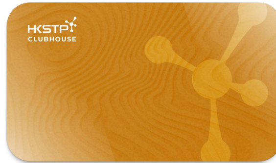
GOLD 金級 會員 Members