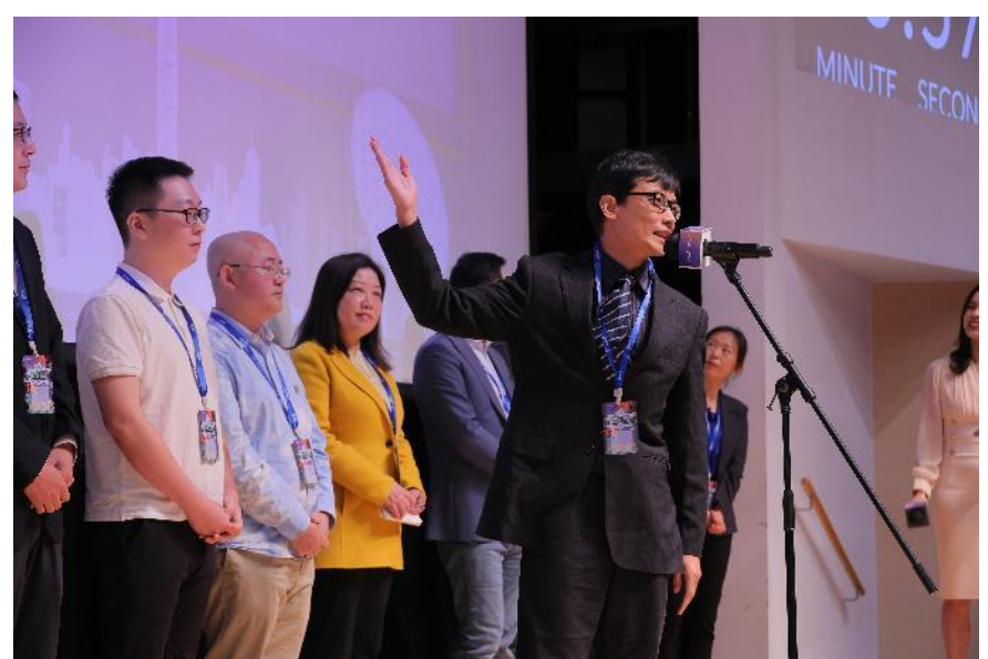
Photo 5: During the interactive "Top Talent Show", talent could share their career aspirations with other guests.

Limited. They explored the competitive edges of Hong Kong such as international level R&D and commercialisation, as well as the opportunities for I&T talent.