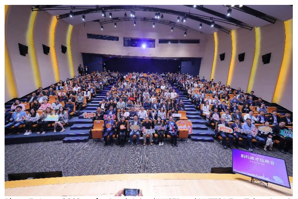
Photo 7: Around 300 professionals joined HKSTP and HKTTSA Top Talent Pass Recruitment Fair today.