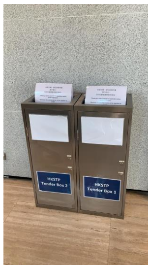
Photo of Tender Submission Box at G/F, Building 5E