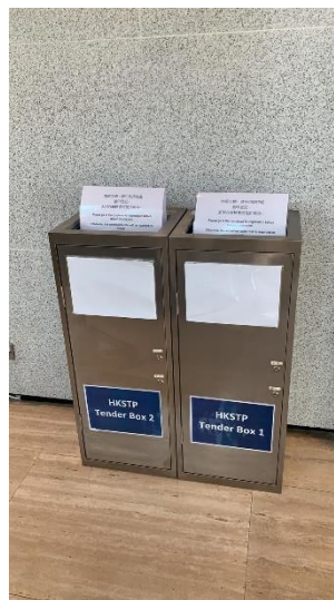
Photo of Tender Submission Box at G/F, Building 5E