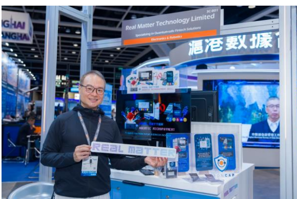
Photo 6: Post-quantum cryptography and Chip-Level Blockchain – Real Matter Technology Ltd.'s post-quantum cryptography (PQC) and chip-level blockchain solutions equips IoT devices and digital infrastructure with next-generation encryption capable of withstanding quantum computing threats, with applications spanning finance, supply chain and smart city deployments.