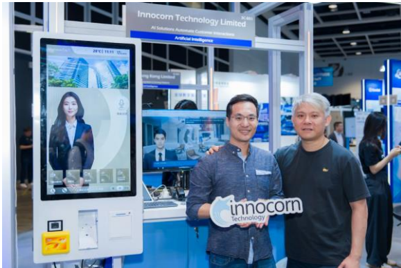
Photo 4: AI Digital Avatars and Intelligent Customer Service – Innocorn Technology Ltd.'s all-in-one AI service platform integrates digital avatars, AI LLM chatbots, voice customer service and physical service robots, delivering seamless omnichannel interactions for enterprises while driving down operational costs.