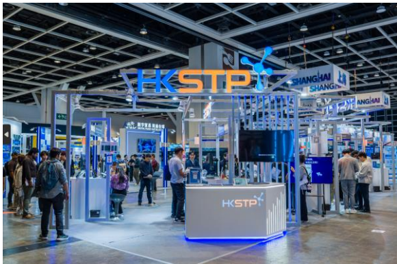
Photo 2: HKSTP brings 16 local innovation and technology companies to InnoEX 2026, showcasing a diverse range of innovation solutions and application scenarios across AI, digital transformation, electronics and robotics, and life & health tech.