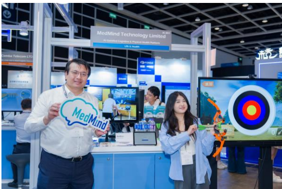
Photo 5: Interactive AI Solutions for Healthcare, Education & Corporate Services – MedMind Technology's NeuroGym and PhysioPlay use culturally grounded games (mahjong, calligraphy) and motion-sensing interaction for cognitive and physical training, supported by automated analytics for real-time personalized reporting. The ecosystem also includes AI Voice Care and AI Avatar systems, serving hospitals, rehabilitation centres, home care, education, as well as corporate functions such as promotion, customer engagement, wellness programmes, CSR, and ESG initiatives.