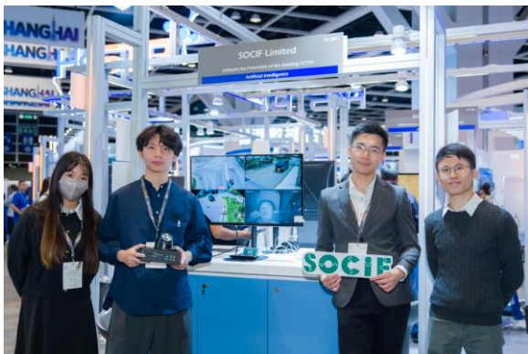
Photo 8: AI Video Analytics for Smarter Crowd and Traffic Management leveraging the existing CCTVs – Developed by SOCIF Ltd., this AI video analytics system delivers real-time intelligent monitoring, tracking and data analysis of pedestrian and vehicle flows, supporting government agencies and enterprises across urban traffic management, commercial space operations and public safety with data-driven decision-making capabilities.