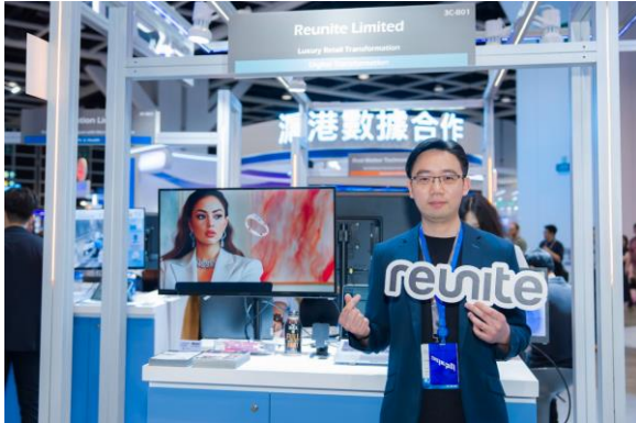
Photo 7: Immersive 3D e-commerce accelerating retail digital transformation – Reunite Ltd. integrates 3D visualisation, immersive e-commerce and automated content production to create highly interactive shopping experiences for consumers.