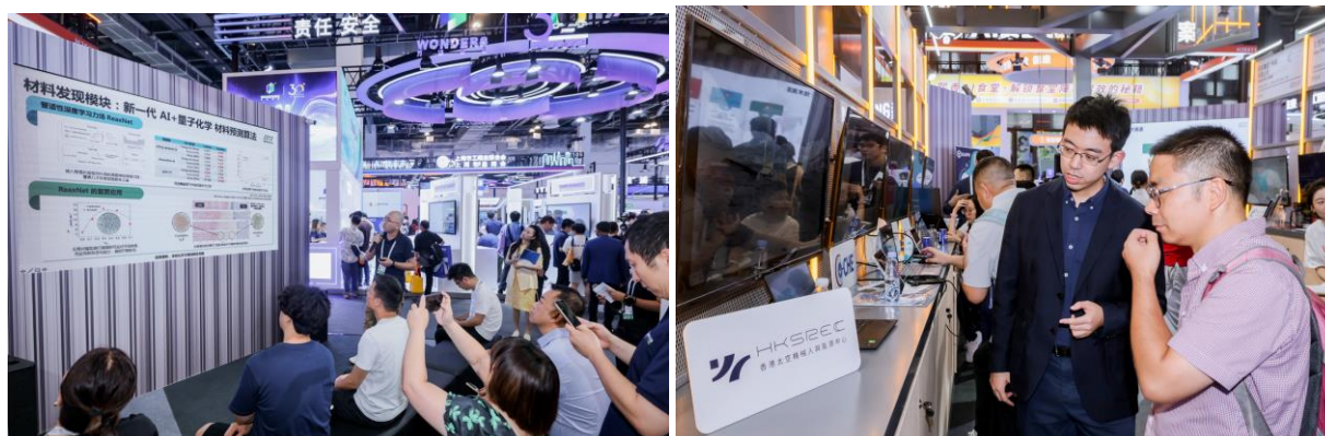
Photo 5-6: Nine park companies participating in the Hong Kong Pavilion cover technologies in life and health tech, fintech, entertainment, aerospace tech, digital education and more.