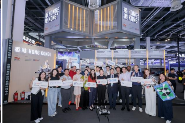
Photo 1-2: HKSTP is embarking on a mission to advance China's AI Plus vision with nine Hong Kong AI park companies at the WAIC 2025.