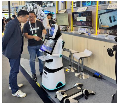
Photo 3-4: The Honourable Duncan Chiu, member of the Legislative Council and Board Member of HKSTP, visited Hong Kong Pavilion at WAIC 2025.