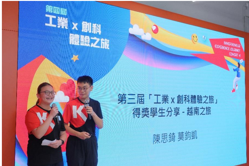
Pic 10: Award winners from the last cohort shared their experiences and insights.