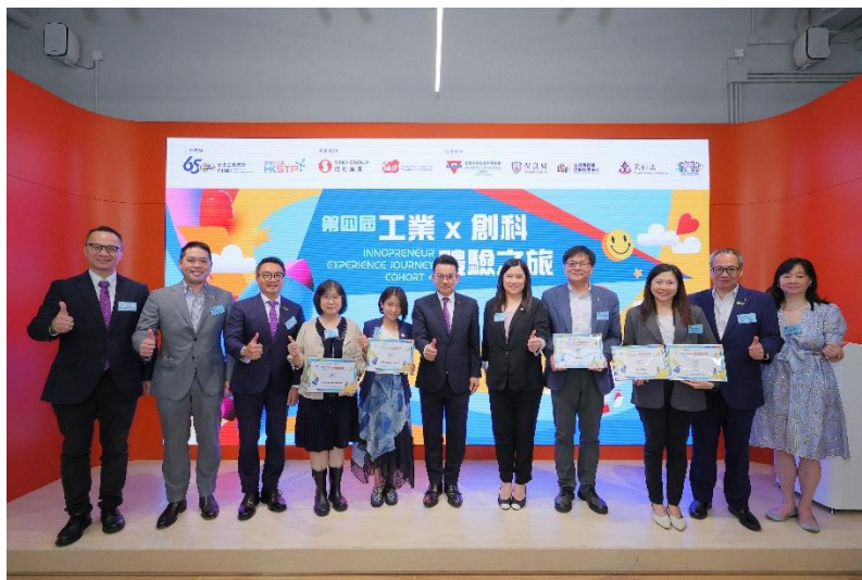
Pic 5: FHKI and HKSTP leaderships took a photo with representatives of programme sponsors and collaborating partners.