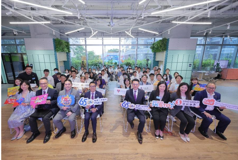
Pic 6: With over 50 students participating and 19 companies serving as corporate mentors, this year's event is a particularly lively one.