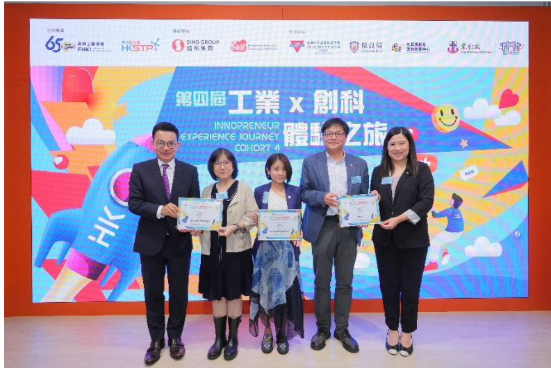
Pic 4: FHKI and HKSTP presented Certificates of Appreciation to collaborating partners, including the Chinese YMCA of Hong Kong Tsuen Wan Centre, the Po Leung Kuk Life Planning and Financial Education Centre, and the Tung Wah Group of Hospitals.