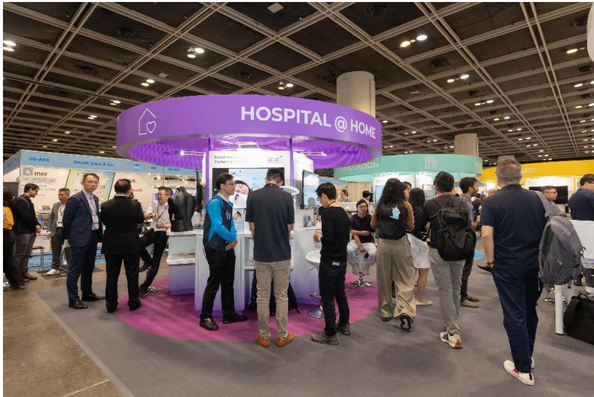
Photo 3: HKSTP has set up an exhibition area themed "Digital Health & Smart Hospitals," featuring six major projects, including technologies to enhance patient admission processes, tools for consultation, surgeries, rehabilitation, patient care in wards, and continuous monitoring at home. It offers multiple AI-empowered smart medical solutions.