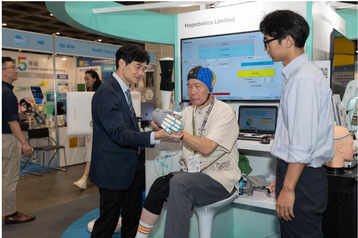
Photo 4: Hopebotics developed HandTasker to provide an exoskeleton rehabilitation solution for stroke patients.