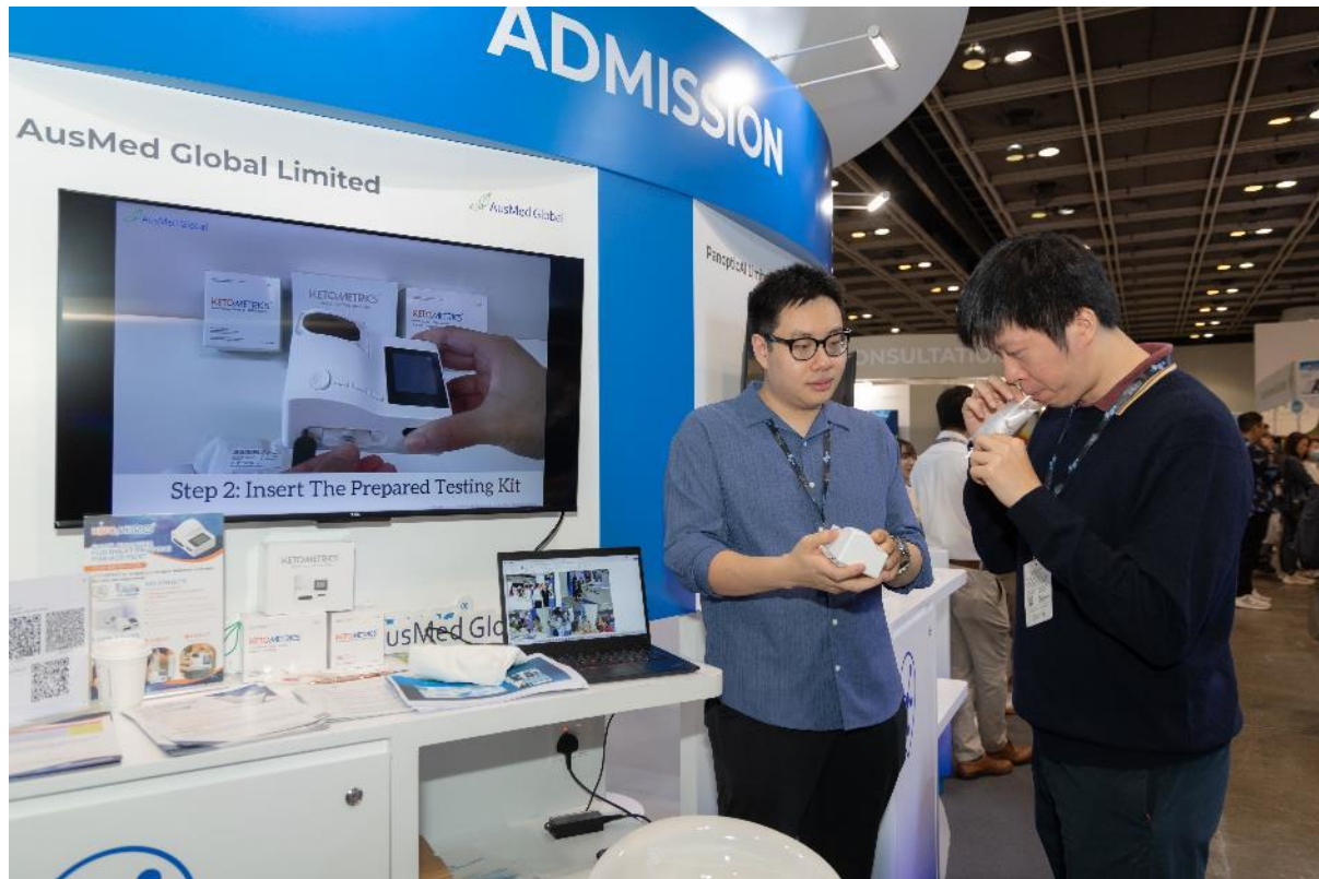
Photo 5: A handheld breath ketone analyzer developed by AusMed, which accurately measures ketones within three minutes from a single breath, assisting diabetes patients in monitoring ketosis and weight control.