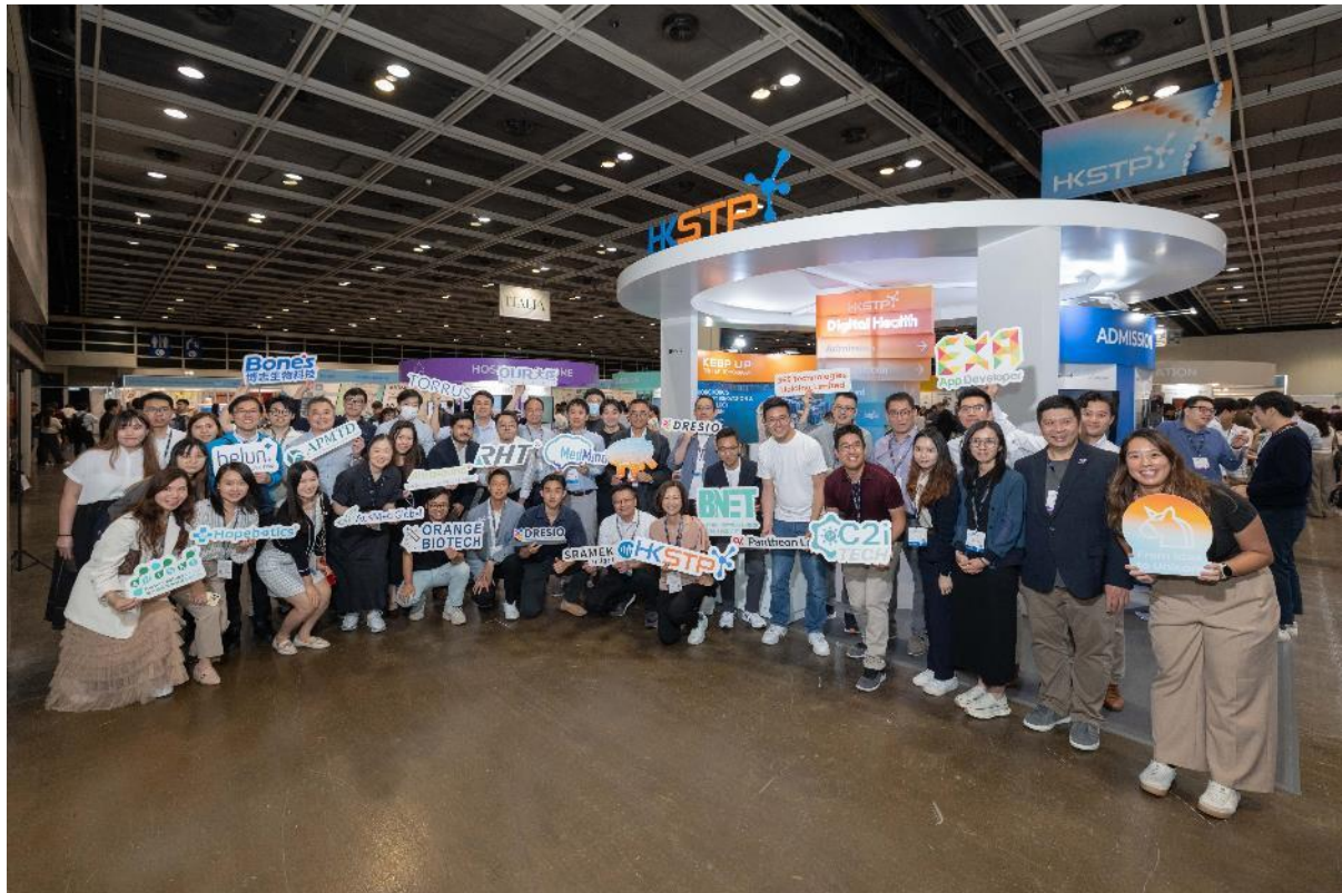
Photo 2: HKSTP led 30 park companies to showcase cutting-edge medical I&T solutions at the Hong Kong International Medical and Healthcare Fair.