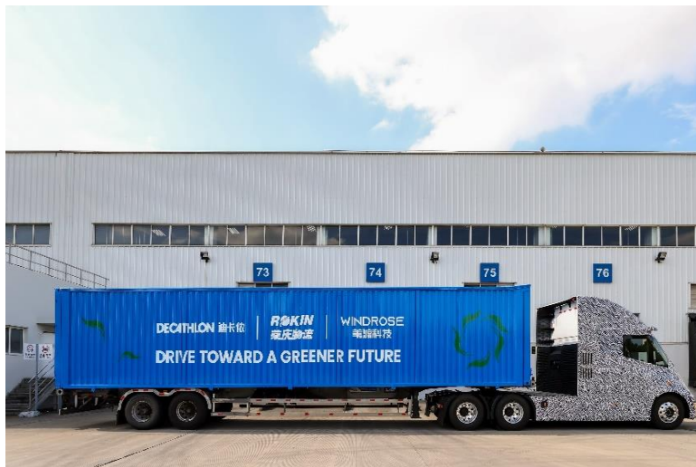
Photo 2: The collaboration between Windrose, Decathlon and Rokin Logistics have united their efforts to address the urgent challenge of carbon emissions, particularly in the logistics industry.