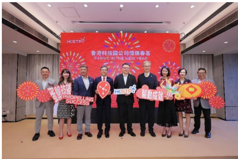
Photos 1: HKSTP hosted a CNY luncheon where the management team reflected on HKSTP's substantial achievements in the past year and shared their aspirations along with an update on the latest developments for the upcoming year.