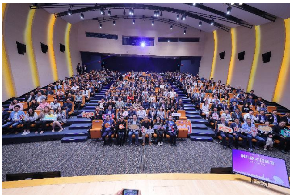
Photo 7: Around 300 professionals joined HKSTP and HKTTS Top Talent Pass Recruitment Fair today.