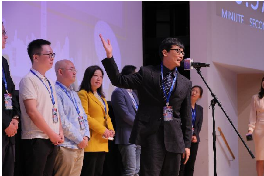
Photo 5: During the interactive "Top Talent Show", talent could share their career aspirations with other guests.

Limited. They explored the competitive edges of Hong Kong such as international level R&D and commercialisation, as well as the opportunities for I&T talent.