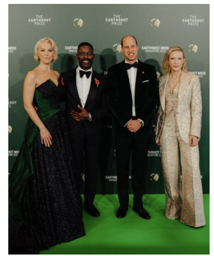
Photo 1: Prince William (second from the right) and Cate Blanchett (right) at the Earthshot Prize awards ceremony.