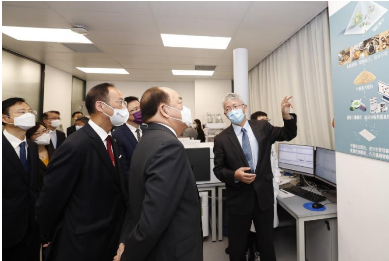
Photo 2: Mr Ho Iat-seng visited the Centre for Chinese Herbal Medicine Drug Development under the InnoHK in cooperation with the University of Macao. The Centre aims to accelerate the research and development of Chinese Herbal Medicine-based drugs and foster collaboration among local and international researchers, academic institutions and practitioners in Chinese medicine.